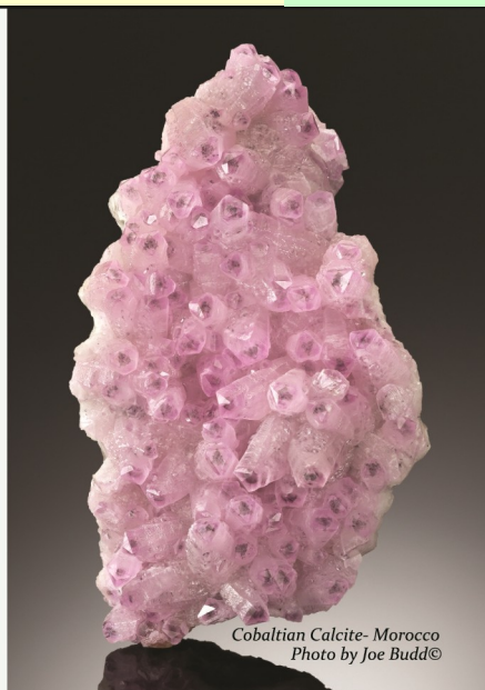
Cobaltian Calcite- Morocco

LLD Productions, Inc. in cooperation with Martin Zinn Expositions, L.L.C., P.O. Box 665, Bernalillo, NM 87004 Fax: (303) 223-3478, mzexpops@gmail.com , www.mzexpops.com Like us on facebook - facebook.com/mzexpops